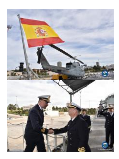
Photo Galleries - A new Force Commander and a new flagship for SOPHIA

From June 2016, when the European Council has also given the task of training the Libyan Coastguard, SOPHIA plays an important role in this activity too: 201 Libyans have been trained so far and the activity will continue in the next coming months.